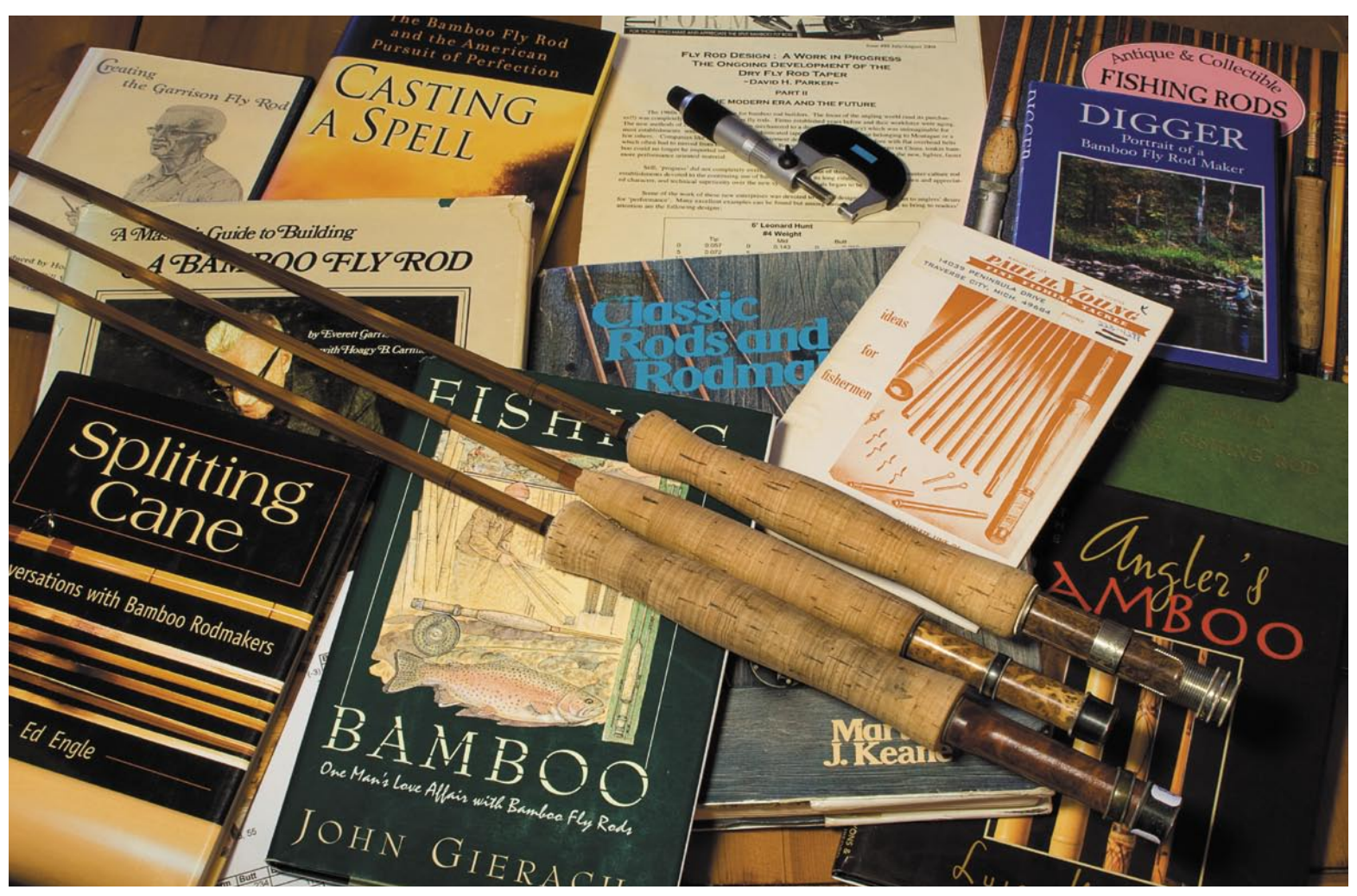
A wealth of reading is available on the subject of bamboo rods and rodmakers.

Early fly rods from the time of Dame Juliana Berners and Charles Cotton were constructed from dowels of timber such as hazel, hickory and greenheart. The late 1600s to early 1800s saw the introduction of Calcutta cane, though in solid sections initially rather than split configuration. As early as 1801, four-strip tip sections were being made by Snart of England. It was an American however, Samuel